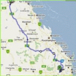
Townsville to Kingaroy Via Charters Towers/Emerald